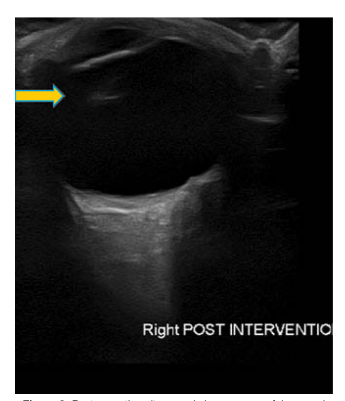
Figure 2: Post-operative ultrasound shows successful removal of foreign body followed by new intraocular lens placement.

thickening of anterior chamber and visual acuity has been reduced to hand perception, however vitreous and posterior chamber appears intact. No evidence of vitreous/retinal detachment or hemorrhage identified. Intraocular pressure was 10 and 15 mmHg in the right and left eyes, respectively. The patient was taken to the operation theatre, and the intraoperative foreign body was removed with subsequent lensectomy and capsulectomy (Fig. 2). The intraocular lens (IOL) was implanted in the capsular bag. The patient was treated with topical antibiotics and steroids which completely calmed the inflammatory reaction. Intraocular pressure gets within normal limits with slow improvement in visual acuity. Two months postoperatively, right-eye visual acuity has improved to 20/25. Ultrasound eye was performed which showed no abnormality (Fig. 3).