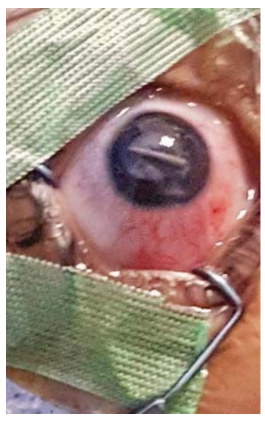
Figure 3: Intraoperative image shows lead pencil nip in lens.