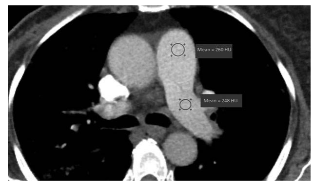
Figure 1: Showing Axial slice through the contrast enhanced CT scan acquired under pulmonary angiogram protocol. The contrast enhancement is measured at both pulmonary trunk and left pulmonary artery levels. The contrast density is seen adequate as per determined values.

Given that contrast enhancement is often lower in more peripheral vessels; therefore, adequacy criteria was applied to the central vessels. Any CT density less than the defined criteria was considered inadequate.