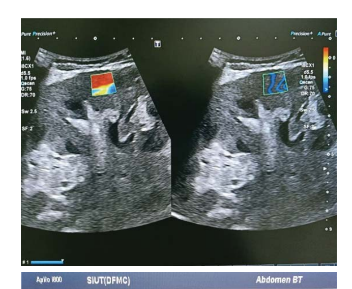
Table 1: Diagnostic accuracy of sonoelastography finding in chronic renal allograft dysfunction