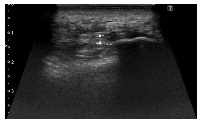
Figure 2: Ultrasound image shows normal plantar fascia thickness

Table 3: Stratification of normal plantar fascia thickness with respect to side affected