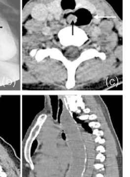
Figure 1: Barium swallow images (a) and (b) showed dilated oesophagus (arrow) with intraluminal mass (*) with filling defect. Transverse CT scan images (c) and (d) showed the stalk of the mass (black arrow) in dilated oesophagus (white arrow). Reformatted sagittal CT images clearly showed the stalk (white arrow) in (e) and inferior margin of the mass (black arrow) in (f).

the stomach. She has a Computed Tomography (CT)