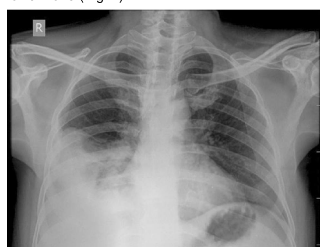
Figure 1: Chest x-ray PA view showing consolidation in right middle zone and right lower zone.

Chest radiograph PA view revealed consolidation with air bronchogram in right middle zone and right lower zone (Fig. 1).