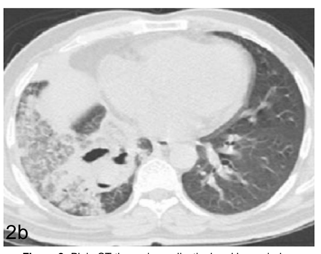
Figure 2: Plain CT thorax in mediastinal and lung window respectively showing dense consolidation with cavitation in apical and basal segments of right lower lobe.

continuity with right pulmonary artery measuring approximately 2.5 x 2 cm was noted in relation to wall of fluid filled cavity - suggestive of pulmonary artery aneurysm (Fig. 3,4). Mediastinum appeared normal. There was no mediastinal or hilar lymphadenopathy.