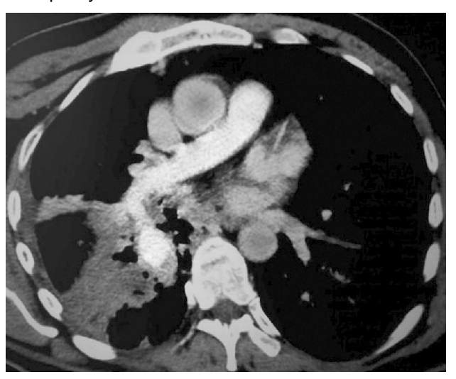
Figure 3: Contrast CT thorax in axial plane showing well defined intensely enhancing lesion in relation to wall of fluid filled cavity in right lower lobe.

continuity with right pulmonary artery measuring approximately 2.5 x 2 cm was noted in relation to wall of fluid filled cavity - suggestive of pulmonary artery aneurysm (Fig. 3,4). Mediastinum appeared normal. There was no mediastinal or hilar lymphadenopathy.