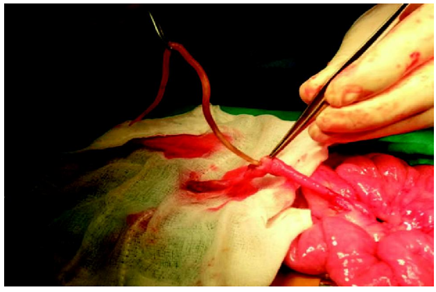
Figure 2A: Open surgery confirmed the diagnosis of ascaris worm within the inflamed appendix.

geon with possibility of acute appendicitis secondary to ascaris in the lumen. Intra-operative exploration revealed distended inflamed appendix with a large ascaris in the lumen (Fig. 2A, 2B) thus confirming the ultrasound diagnosis.