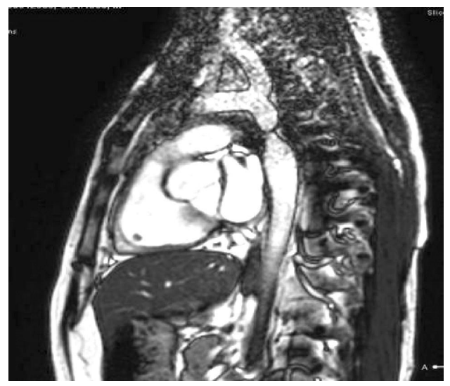
Figure 3: Aortic sequences showing co-arctation of the aorta in 26 years old man.

More than 400,000 women in the United States die every year from cardiovascular disease (CVD),making it the leading cause of death in the United States.<sup>1</sup> In addition to its ability to provide anatomical and functional data, magnetic resonance (MR) can also provide tissue characterization, a technique that will help distinguish vulnerable coronary plaques from stable ones, and which is considered to be the holy grail for cardiac diagnostic imaging.<sup>2</sup>