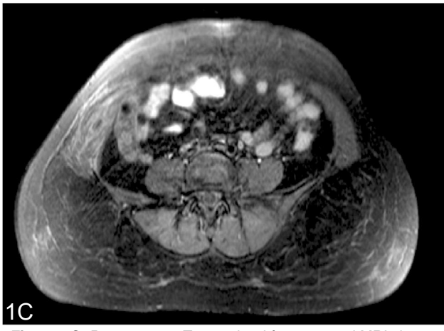
Figure 1C: Post contrast T1-weighted fat-saturated MRI shows hypointense lesion with inflammation in internal oblique muscle.

On HRUS, a small cyst of size 6.5 mm containing an echogenic nidus was seen in the right internal oblique muscle (Fig. 2). Based on ultrasound and MRI findings, a diagnosis of intramuscular cysticercosis was made. Extensive search was made to exclude disease at other site. Further investigation with screening cerebral MRI did not revealed any evidence of cysticercosis. None of her family member had any history of cysticercal infection.