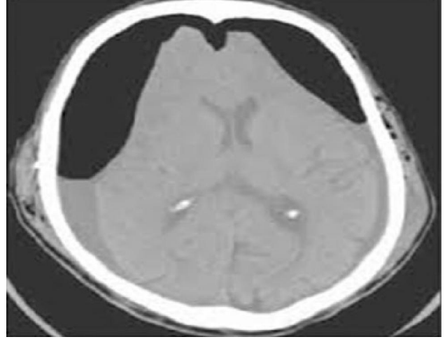
Figure 1: A "peaking sign" of bilateral compression of the frontal lobes by subdural air collections without the characteristic separation of the frontal lobes has also been linked to tension pneumocephalus

hemispheric fissure and separated frontal lobar tips appearing as symmetrical cone shaped peak of Mount Fuji is a critically important sign. Ishiwata et al found this sign useful in diagnosing tension pneumocephalus, as it was not seen in any patient with nontension pneumocephalus.<sup>1</sup>