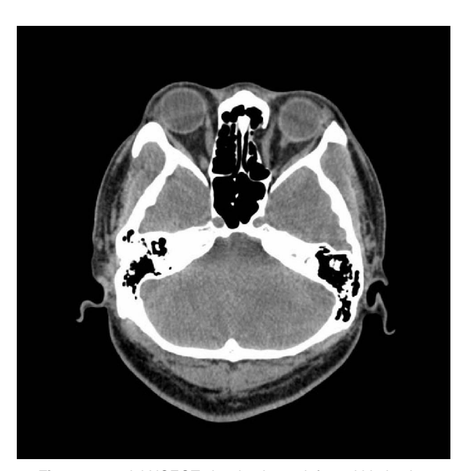
Figure 2a: axial NCECT showing bony defect within lamina papyracea with herniation of orbital fat and medial rectus